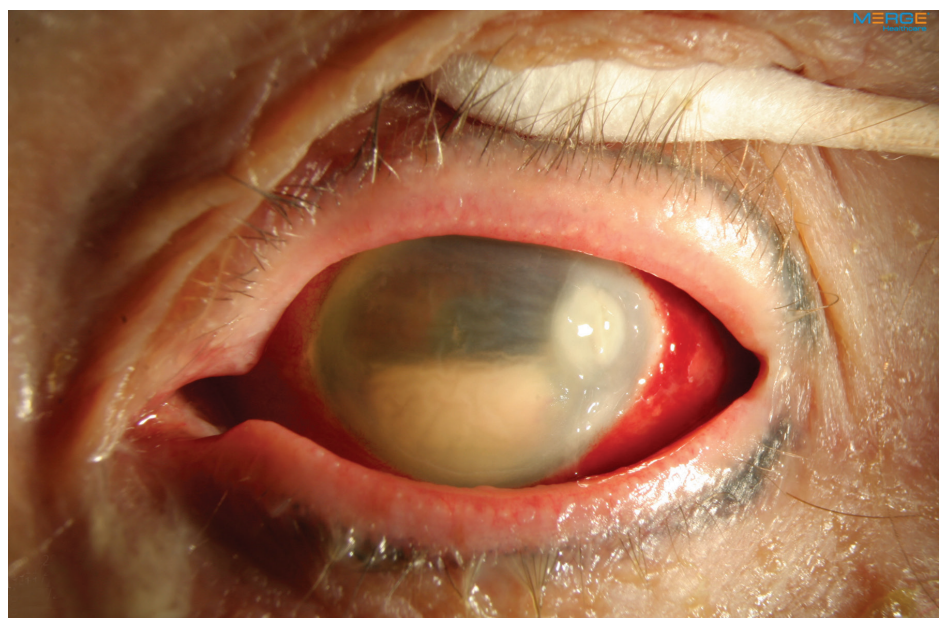
Figure 1 Hypopyon is an accumulation of white blood cells in the anterior chamber of the eye and corneal infiltrate associated with infectious endophthalmitis. Image courtesy of ©Retina Image Bank, contributed by Aleksandra V. Rachitskay, MD, Cole Eye Institute, Cleveland Clinic. 2014. Image 16250.

Endophthalmitis is an infection inside the eye that can either be acute or chronic, meaning that it can develop very rapidly which is most common, or develop slowly and persist for long periods of time