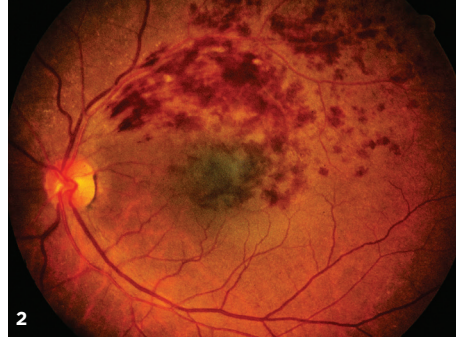
continued next page