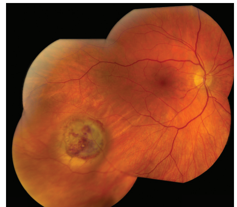
Figure 4. Small/medium malignant choroidal melanoma after brachytherapy. Tumor size reduced by 40%. Notice small bleeding from the radiation.