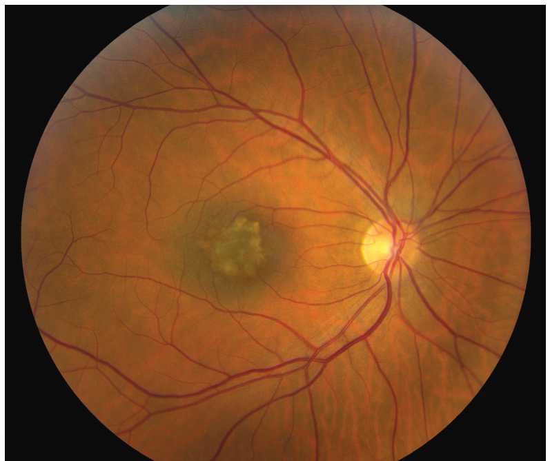
Figure 2. Small benign macular choroidal freckle/nevus.