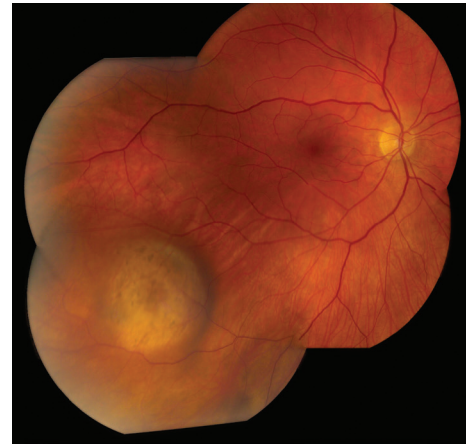
Figure 3. Small/medium malignant choroidal melanoma.